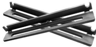
Pair of Dovetail Brackets for UPBv2