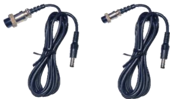
Power cable for Skywatcher EQ8 or Power cable for Skywatcher EQ6R / EQ6-AZ