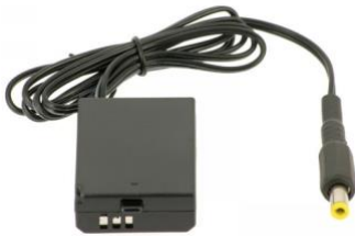
Battery Coupler for DSLR /Mirrorless Cameras