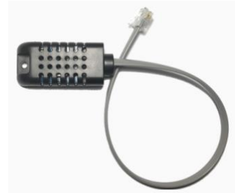
1 x Environmental Sensor