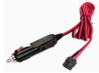
1 x DC Cable (XT60) to Cigarette Lighter (10 fused)