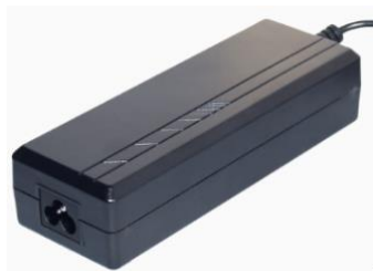
Power Supply Unit 12v/10A XT60 Plug