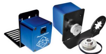
Pegasus Stepper Motor Kit (Universal L shape Bracket or SCT Bracket)

Device is covered by two (2) years warranty Designed and Assembled in Greece