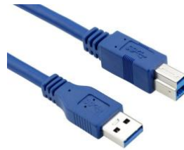
1 x USB3 Cable Type B (1.8m)