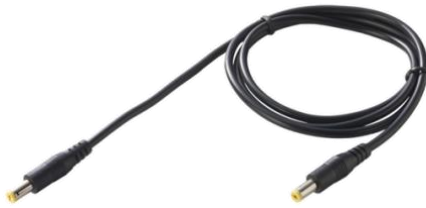
4 x Power Cables (1 meter)