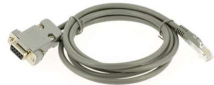
Stepper Motor Cable (Robofocus Pinout) RJ45 to DB9