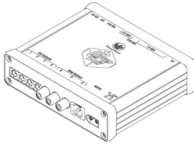
Ultimate Powerbox v2