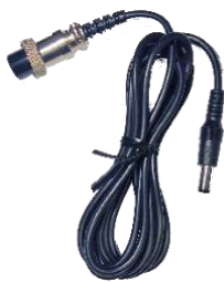
Power cable for Skywatcher EQ8