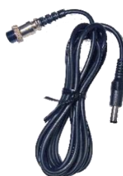
Power cable for Skywatcher EQ6R / EQ6-AZ