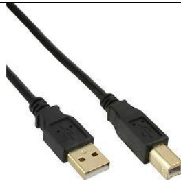
1 x USB Cable Type B (3m)