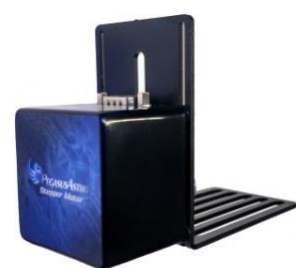
Pegasus Stepper Motor Kit (Universal Bracket)

Device is covered by two (2) years warranty