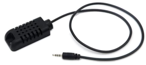
1 x Environmental Sensor (1meter)