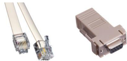
Stepper Motor Cable (Robofocus Pinout)