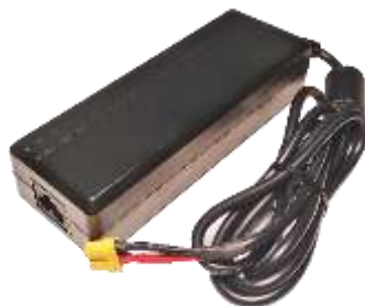
Power Supply Unit 12v/10A XT60 Plug