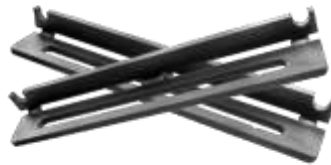
Pair of Dovetail Brackets for UPBv2