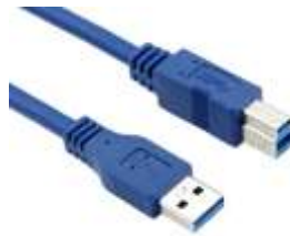
1 x USB3 Cable Type B (1.8m)