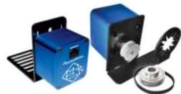
Pegasus Stepper Motor Kit (Universal L shape Bracket or SCT Bracket)

Device is covered by two (2) years warranty Designed and Assembled in Greece