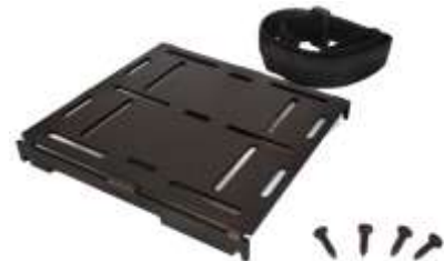
Small Factor PC Baseplate (Mini PC and RPI)