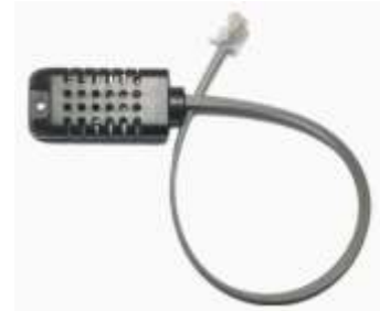
1 x Environmental Sensor