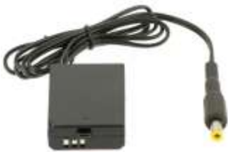
Battery Coupler for DSLR /Mirrorless Cameras