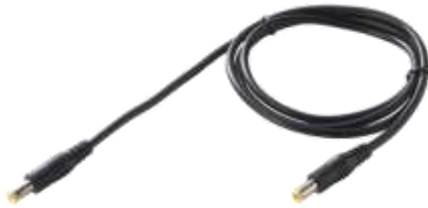
4 x Power Cables (1 meter)