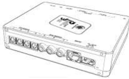
Ultimate Powerbox v2