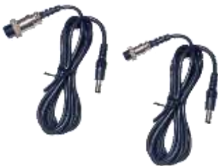
Power cable for Skywatcher EQ8 or Power cable for Skywatcher EQ6R / EQ6-AZ