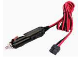
1 x DC Cable (XT60) to Cigarette Lighter (10 fused)