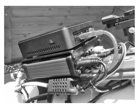
You are ready to go !!!

Make sure that the qap of the baseplate faces the side of USB ports.