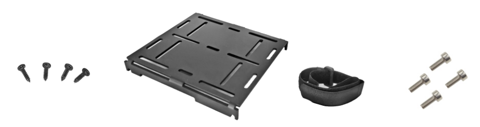
Step 1 Check which version of enclosure you have and use the appropriate screws.

1 x Baseplate 1 x Hook & loop strap 4 x M3.5 screws (old enclosure) 4 x M3 screws (new enclosure)