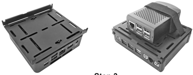
Step 3 Place the baseplate on top of the UPBv2 and use the appropriate screws to securely lock it.